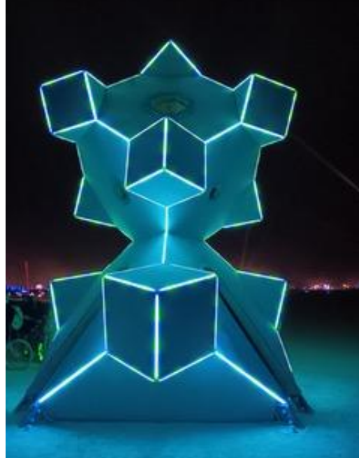
The Complexahedron, 2023