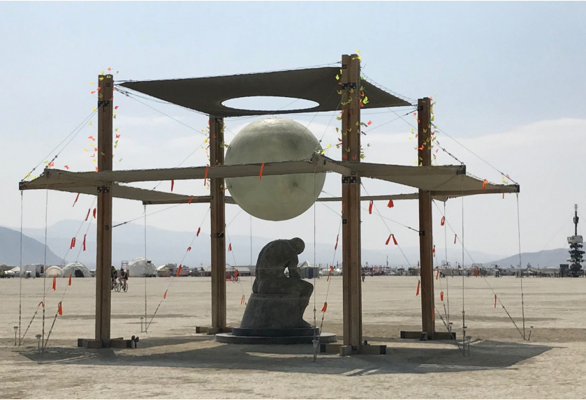
The Monument of Indecision, 2018