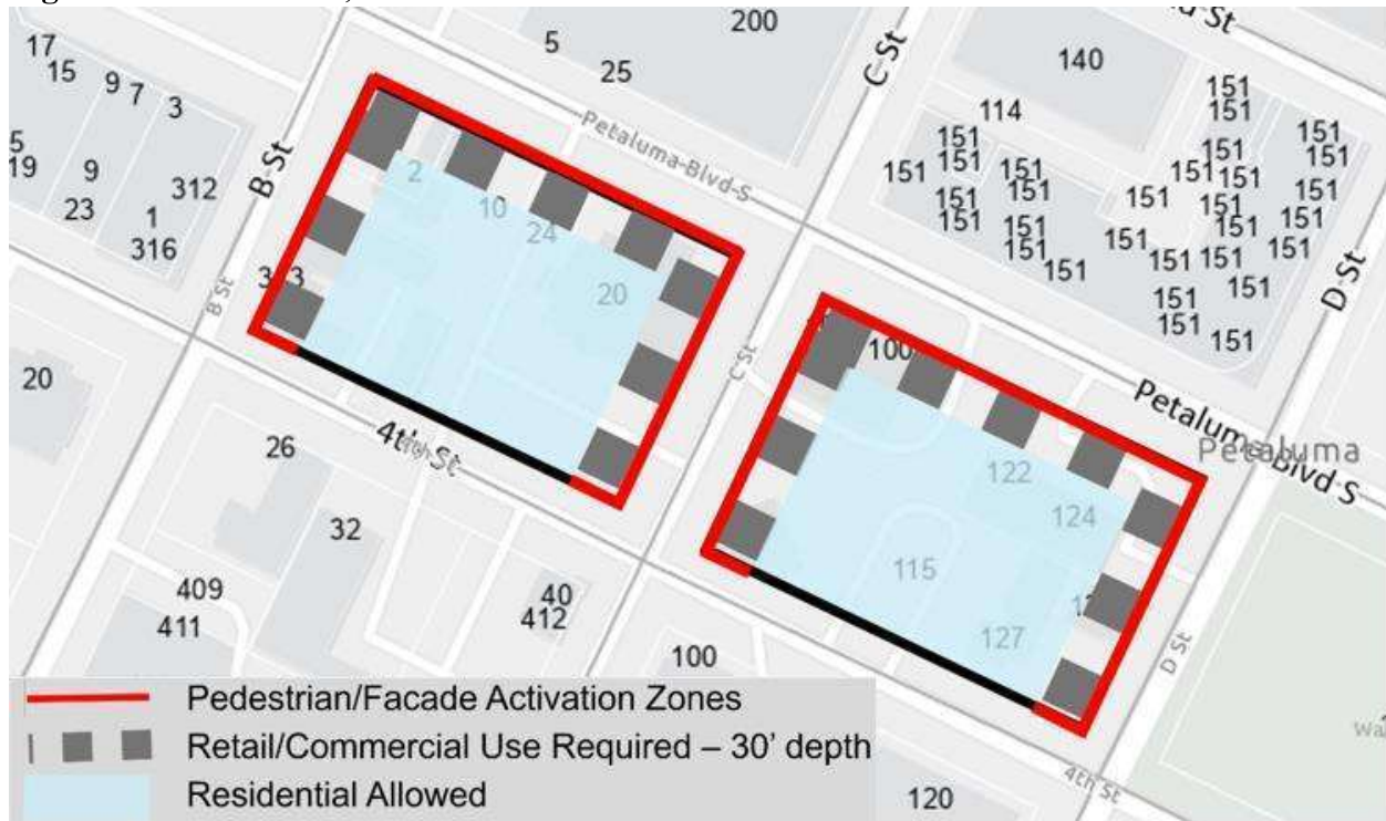
Figure 5.2: Subarea A, Pedestrian/Facade Activation Zones + Residential Allowed Zones