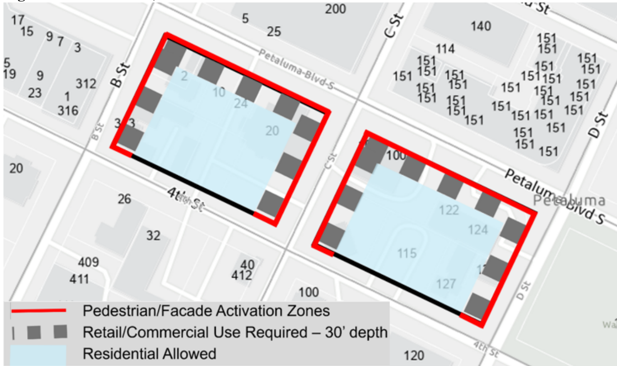
Figure 5.2: Subarea A, Pedestrian/Facade Activation Zones + Residential Allowed Zones