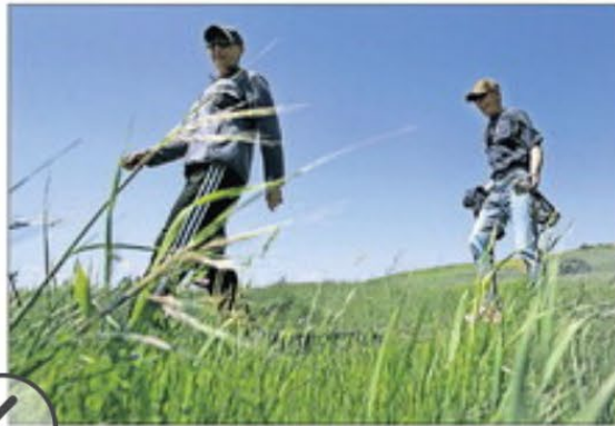
Bikers get fresh air and sunshine at Helen Putnam Regional Park south of Petaluma.