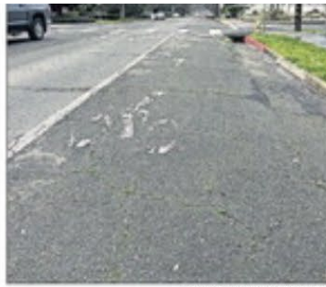
The bike lane on D Street at 8th Street in west Petaluma is shared with street parking.

One example of many: In 2022, State Department diplomat Sarah Langenkamp, who had recently returned from Ukraine, was killed in a bike lane on a major Maryland road. A Volvo flat-bed truck