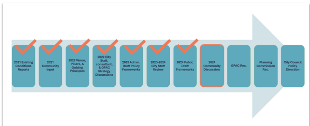
Figure 2: Policy Framework Development and Review Process

The draft Policy Frameworks were developed through an extensive process that included a wide range of inputs. Figure 2 diagrams the process to arrive at and review the Policy Frameworks.