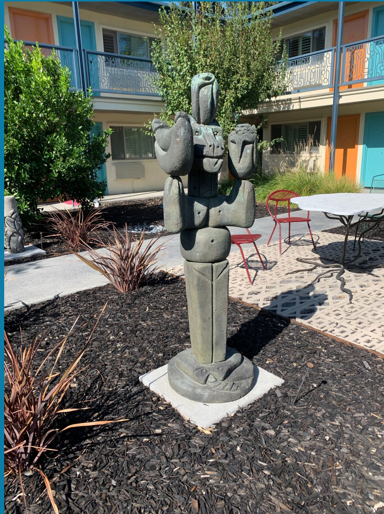
Coyote Goddess 65"h x 20"w x 20"d