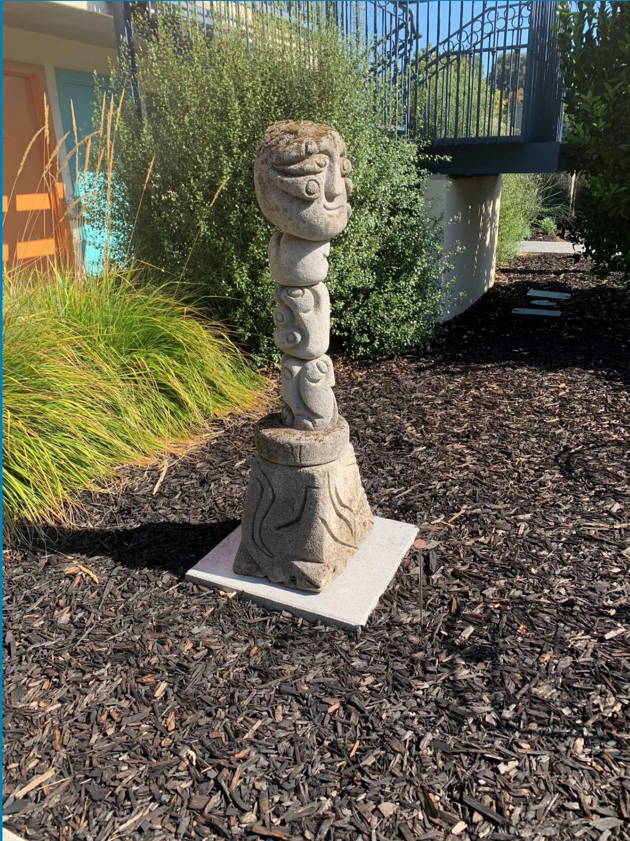
Totem 53"h x 18"w x 13"d