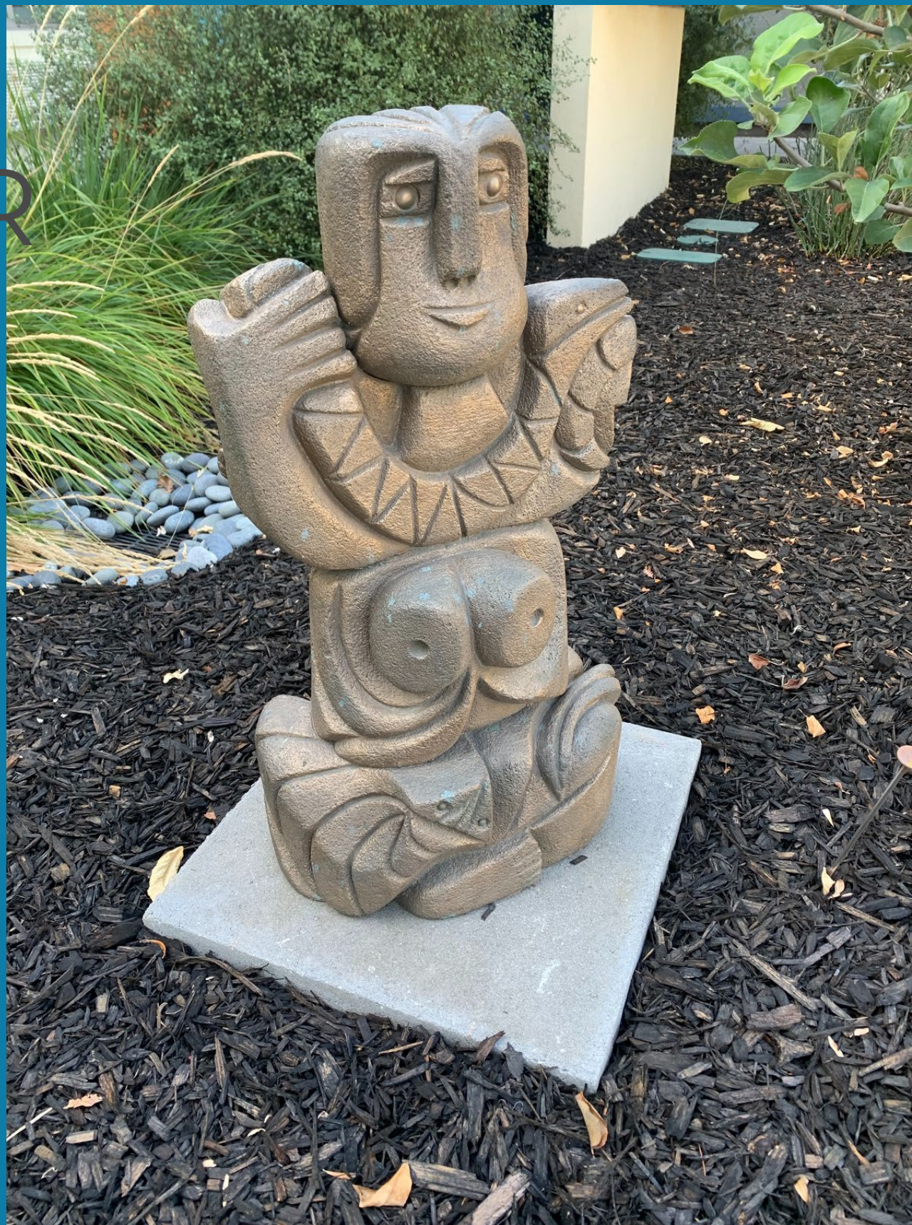
Snake Goddess 36"h x 20"w x 14"d