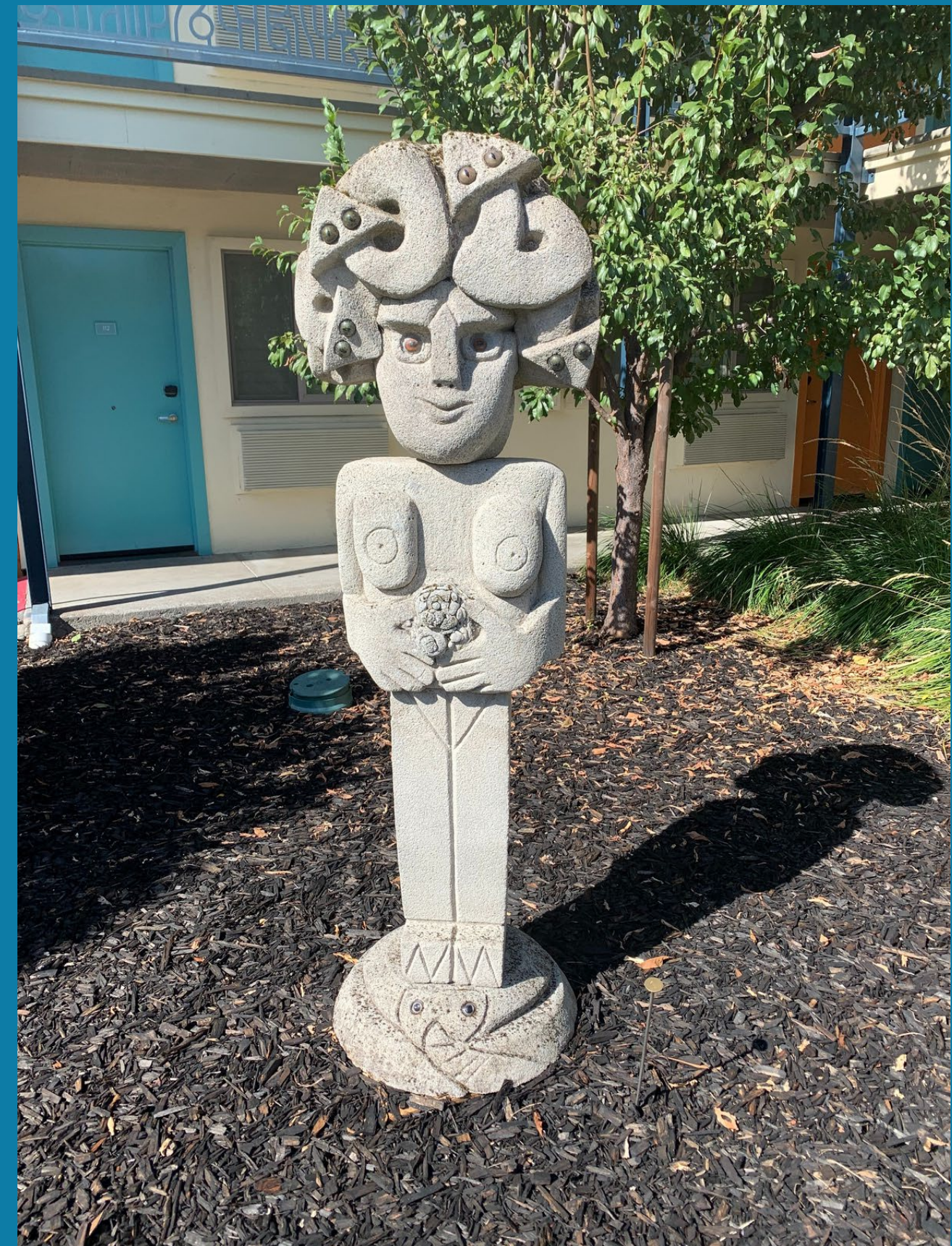
Medusa 68"h x 22"w x 21"d