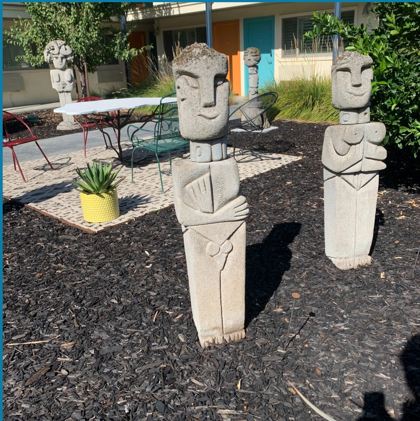
Male Totem 48"h x 12"w x 10"d/ Female Totem 48"h x 11"w x 9"d