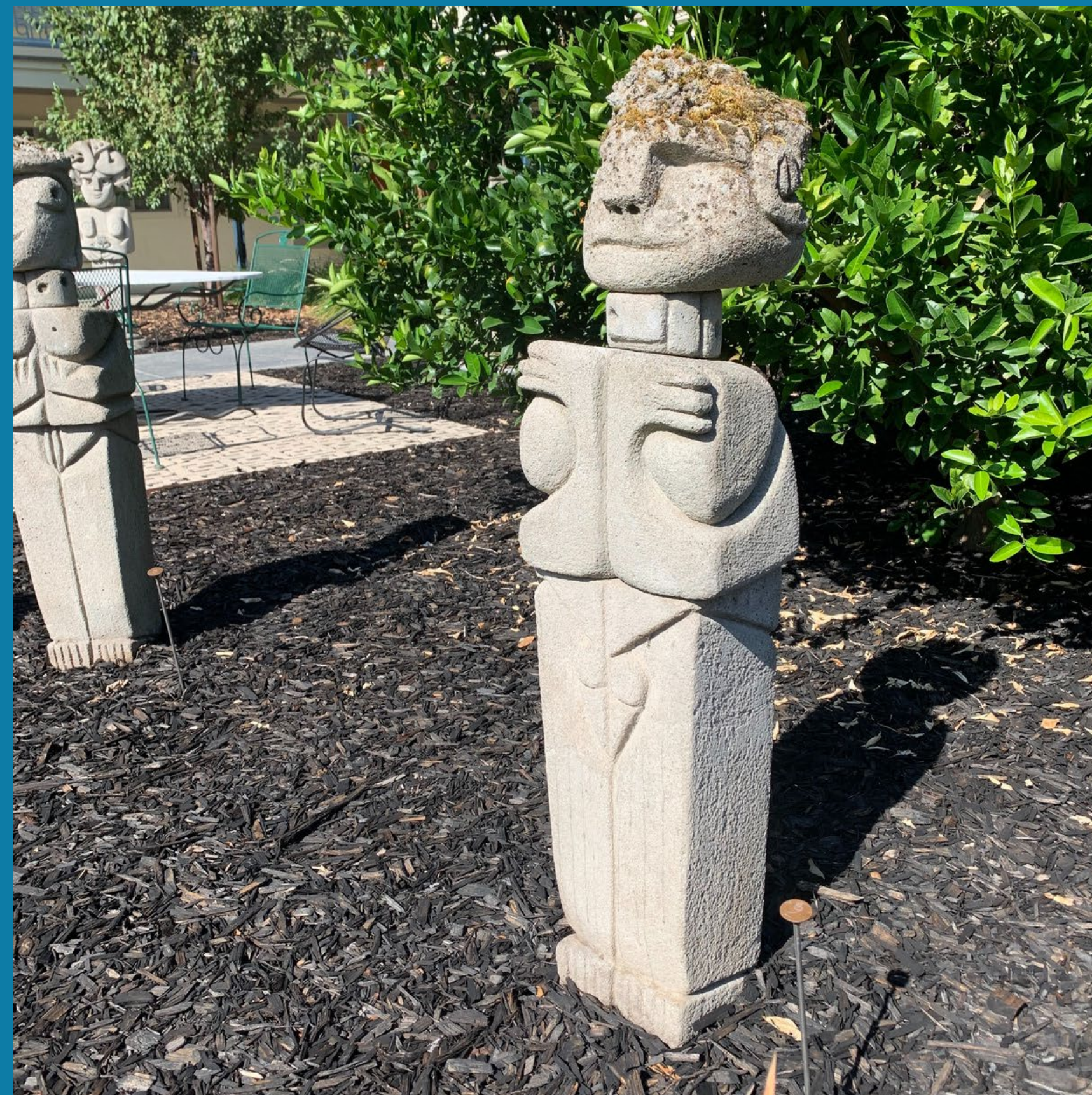
Male Totem 2 48"h x 12"w x 10"d