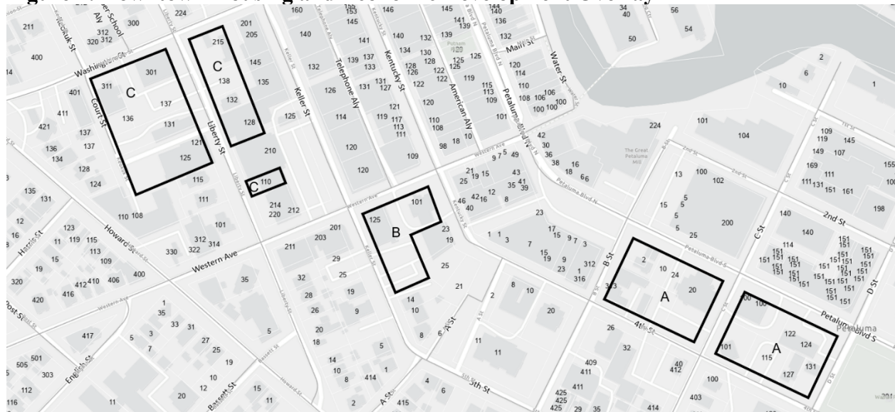
Figure 1: Downtown Housing and Economic Development Overlay