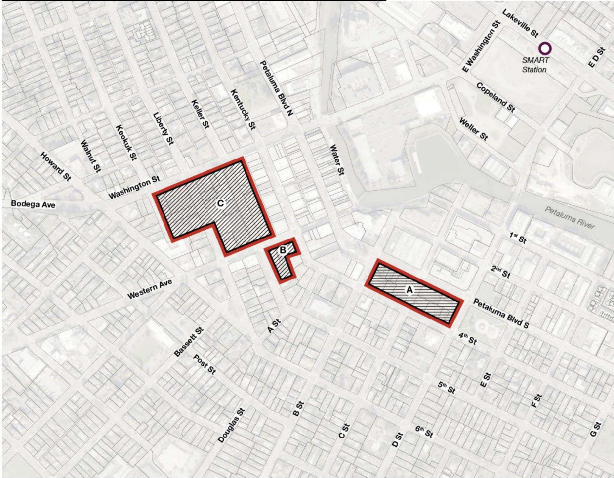
Figure 5.1: District Boundaries Downtown Housing and Economic Development Overlay

C: Ground Floor Uses, Pedestrian/Façade Activation Zone and Ground Floor Residential Use Zone. To continue the land uses and forms established by the parcels that abut or confront each subarea and to allow for specific land uses and the design of new buildings to reflect the characteristics and the context of each subarea a “Pedestrian/Façade Activation Zone” & a “Ground Floor Residential Use Zone” will apply to each subarea.