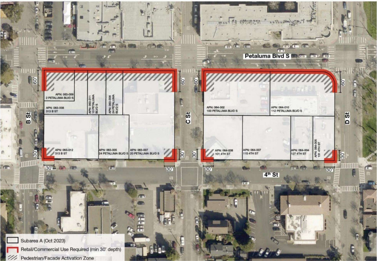
Figure 5.2: Subarea A, Pedestrian/Facade Activation Zones + Residential Allowed Zones