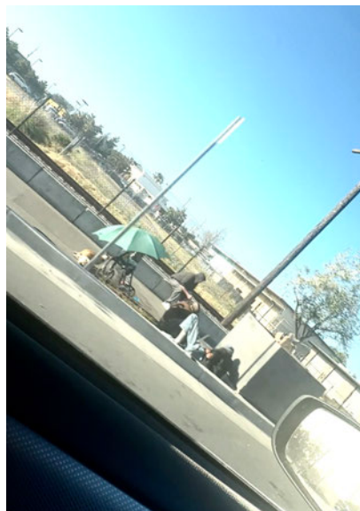
Hazardous erratic behavior & loitering