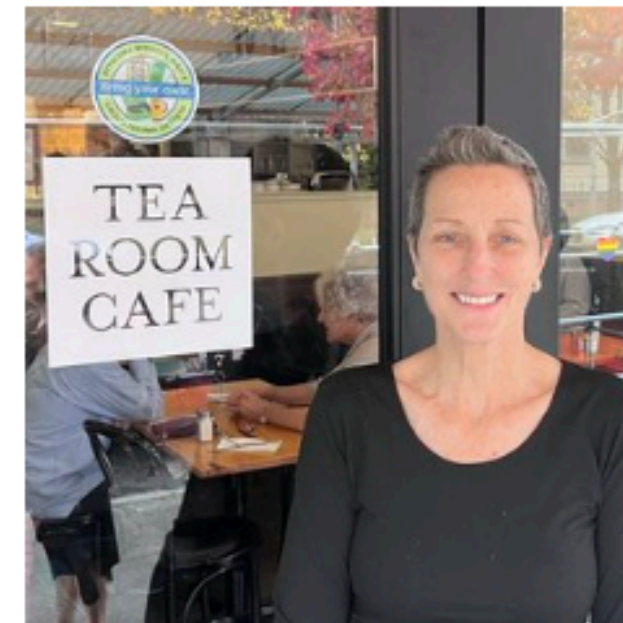
Tea Room Cafe - 316 Western Ave