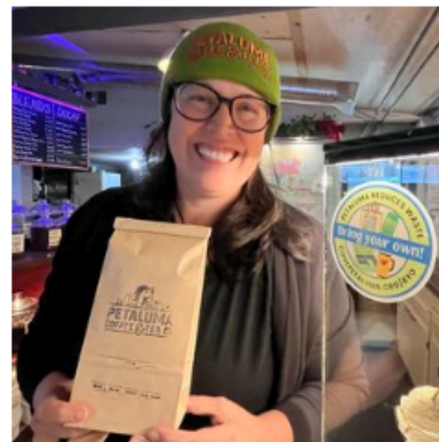
Petaluma Coffee & Tea - 212 2nd St