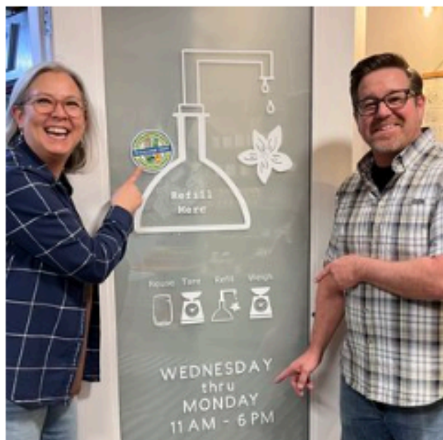
Refill Mercantile - 6 Petaluma Blvd N Suite All ...