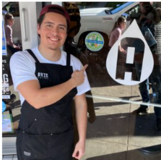
Avid Coffee - 21 4th Street

These local businesses have all pledged to help support this Bring Your Own campaign, so please grab your travel mug or reusable container and head on over to their storefronts!