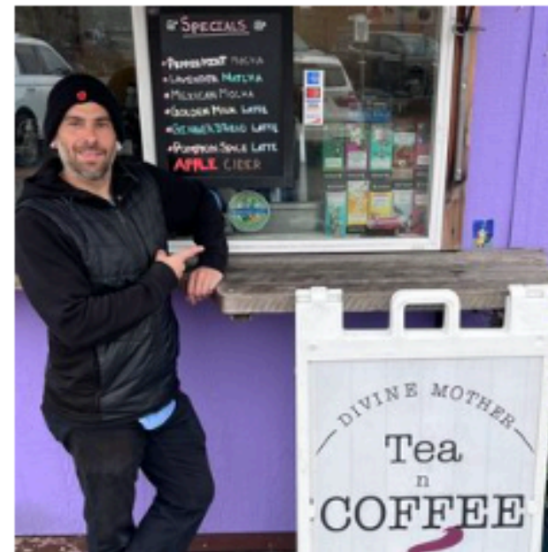
Divine Mother Tea n Coffee - 40 4th St (Mail ...