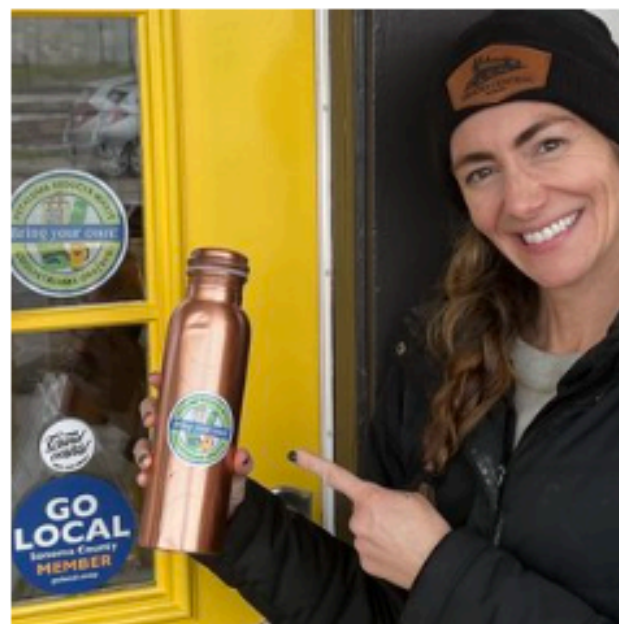
Grand Central Petaluma - 226 Weller St