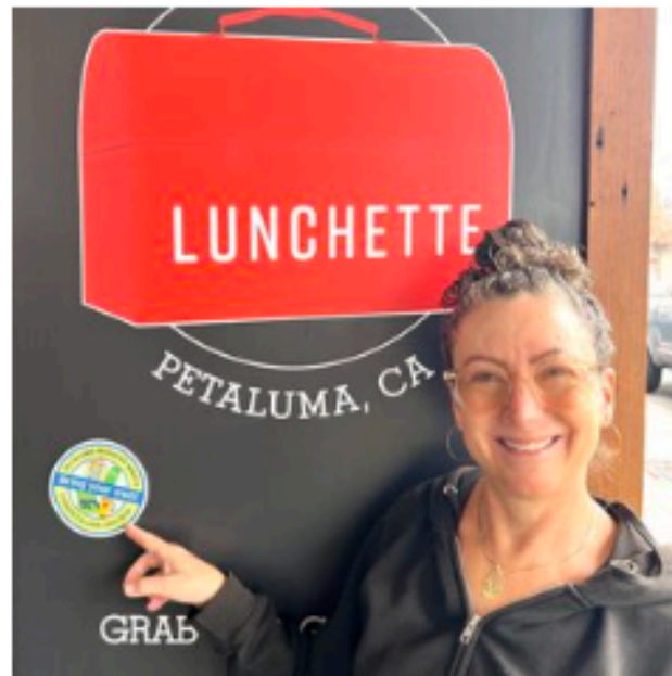
Lunchette - 25 4th Street