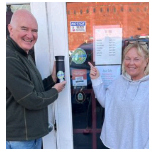
Aquas Cafe - 189 H Street