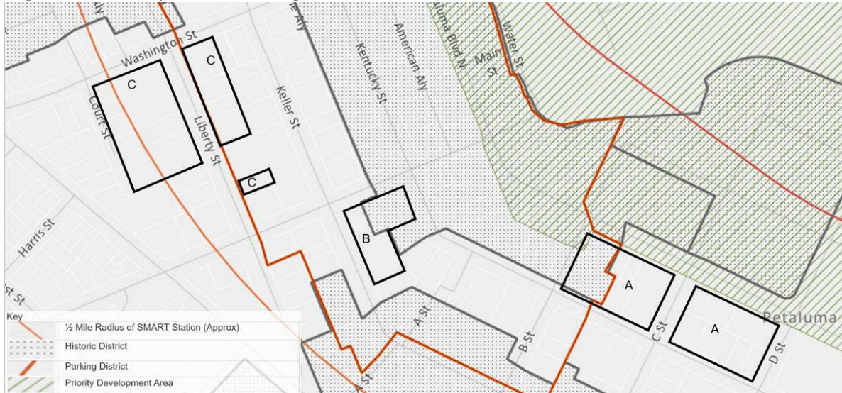
Figure 2: Overlay & Combining Districts

The MU2 zone implements the MU General Plan Land Use. It is applied to Downtown Petaluma and adjacent areas intended to evolve into the same physical form and character of development as that in the historic Downtown area. Currently, the MU2 zone permits residential uses in a mixed-use building by-right, whereas exclusively multi-family residential developments are prohibited. Current development standards for the MU2 zone, as provided in Table 4.10 of the IZO are included in Error! Reference source not found. below.