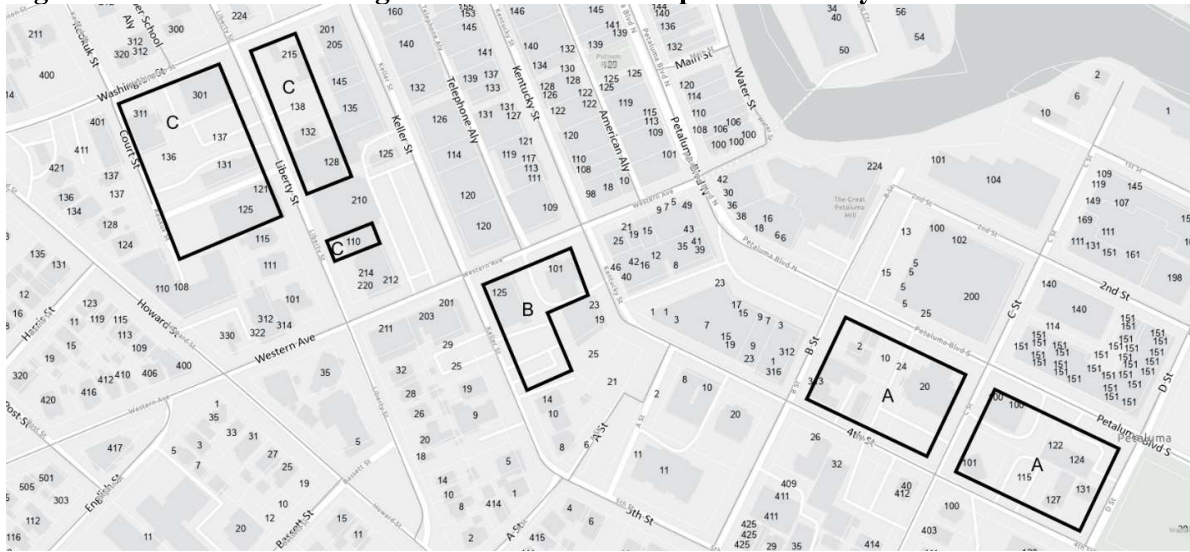
Figure 1: Downtown Housing and Economic Development Overlay