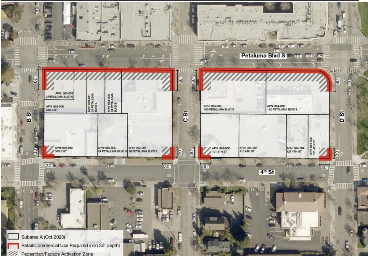
Figure 5.2: Subarea A, Pedestrian/Facade Activation Zones + Residential Allowed Zones