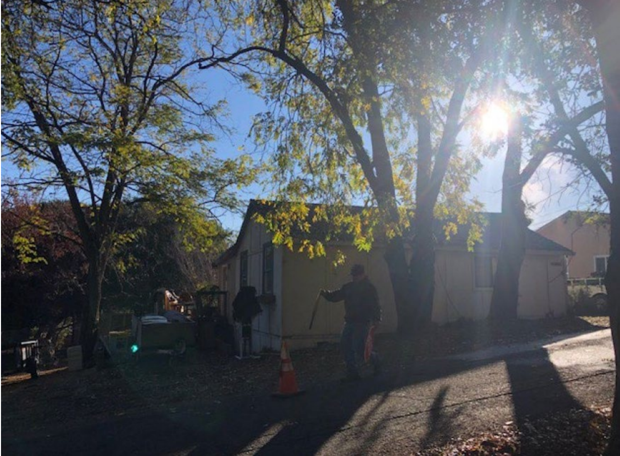
Mature walnuts removed November 12, 2022 (on site walnut removed 12-12-23)