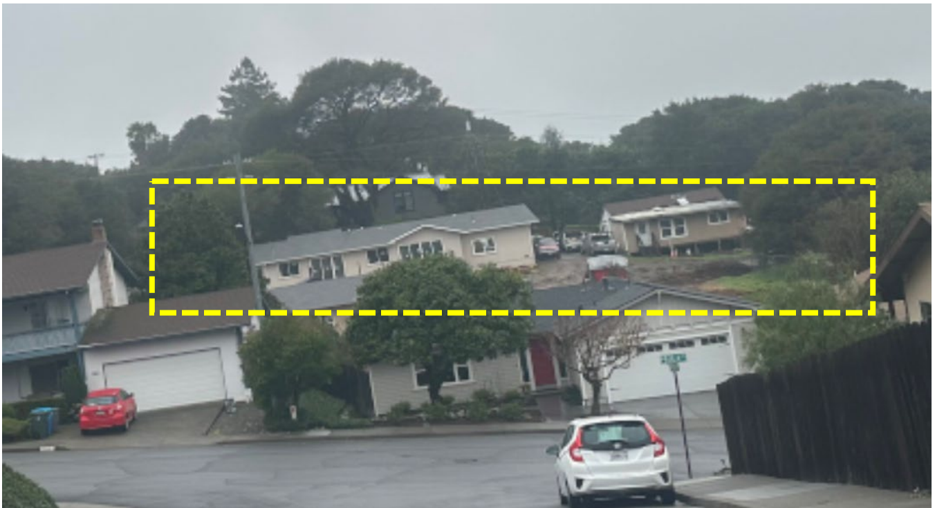
View of property, 1-17-2024