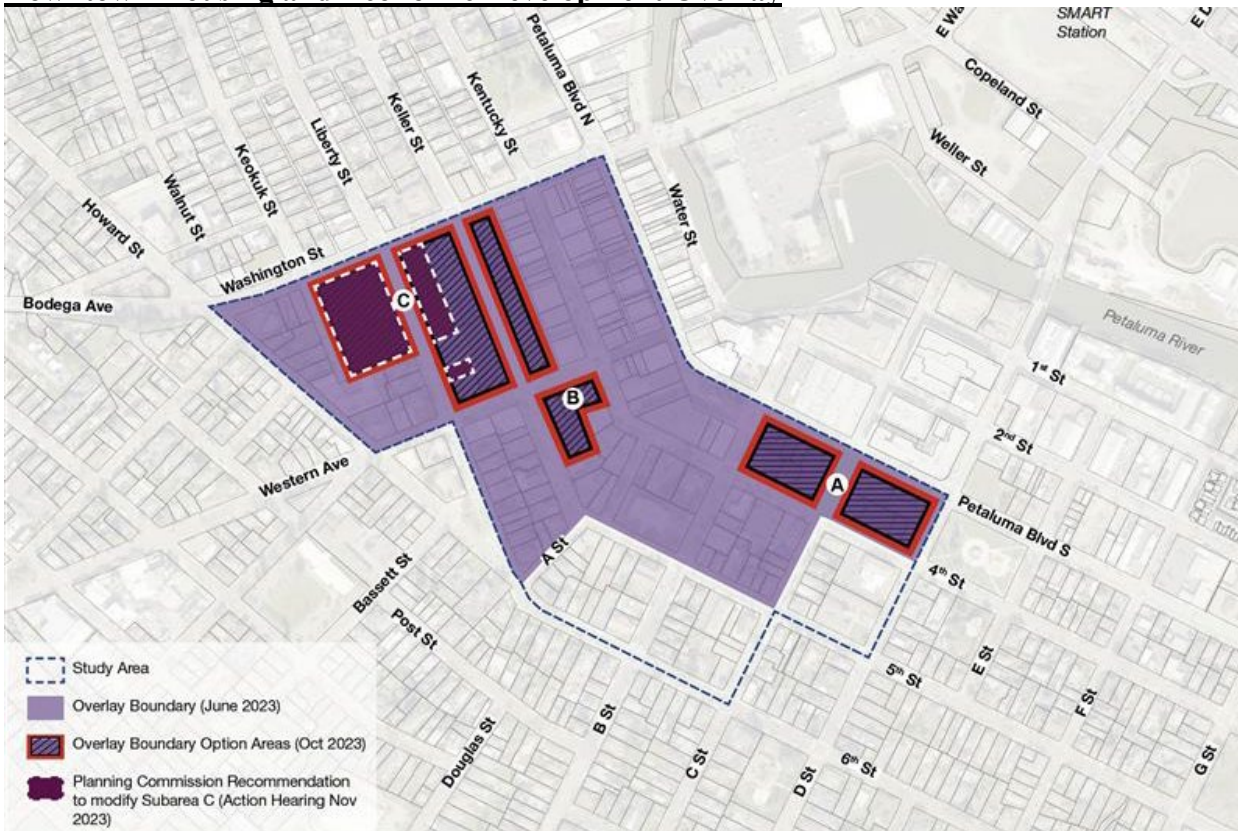
Figure 5.1: District Boundaries Downtown Housing and Economic Development Overlay

B: Ground Floor Uses, Pedestrian/Façade Activation Zone and Ground Floor Residential Use Zone. To continue the land uses and forms established by the parcels that abut or confront each subarea and to allow for specific land uses and the design of new buildings to reflect the characteristics and the context of each subarea a “Pedestrian/Façade Activation Zone” & a “Ground Floor Residential Use Zone” will apply to each subarea.