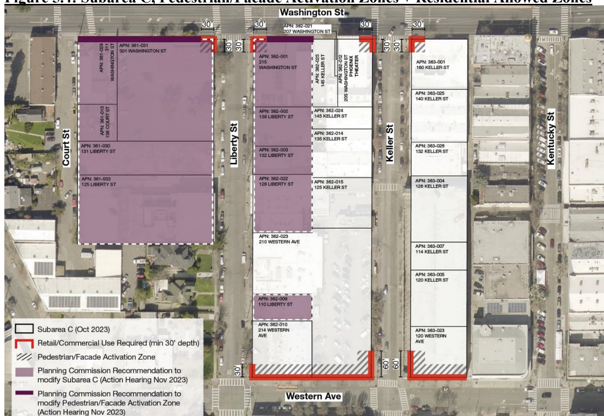
Figure 5.4: Subarea C, Pedestrian/Facade Activation Zones + Residential Allowed Zones

C: Development Standards, General. Development Standards in the Downtown Housing and Economic Development Overlay Zone shall be as provided for in Chapter 4- Tables 4.10 & 4.13, except as provided for in Table 5.2, below.