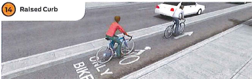
At east end without parallel parking, design to be travel lane, buffer, bike lane.