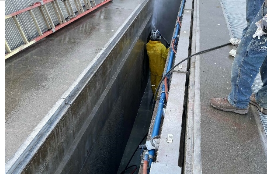
Cleaning and Surface Preparation