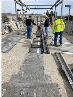
UV Equipment Removal