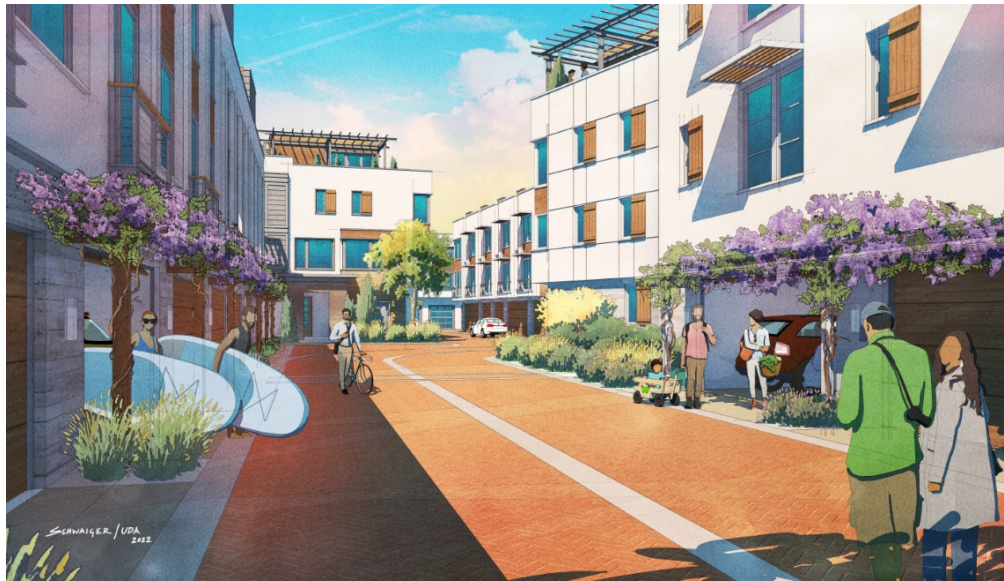
Figure 6: Internal alleyways provide unit access and support multi-modal activity

pathways provide access throughout the project site, and 20- to 26-foot-wide alleyways are proposed to provide internal vehicular access for fire apparatus, service trucks, and personal vehicles. The alleyway network is intentionally designed to limit vehicular speeds to a safe minimum in order to support and encourage pedestrians and bicyclists. Each building would have an elevation facing pedestrian pathways where pedestrian entrances to residences are located and an elevation facing internal alleyways where vehicles may access residential garages.