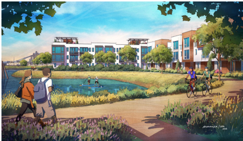
Figure 8: River Trail around McNear Canal

Open space areas within the project site, including the alleyways, trails, landscaping, lighting, and bioretention areas, would be maintained by the Oyster Cove Homeowner's Condominium Association.