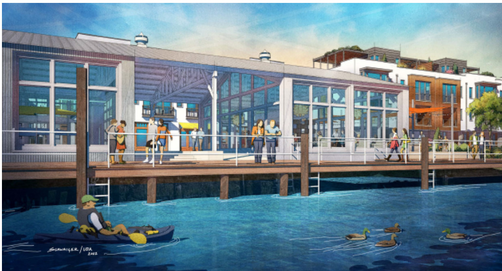
Figure 5: Adaptive re-use of the Oyster Shed and future water access