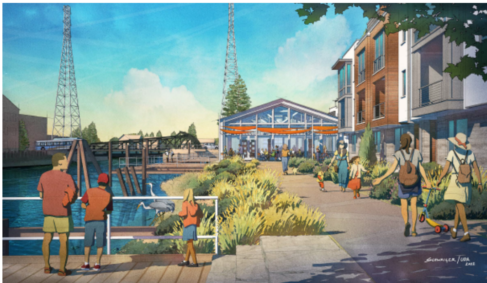
Figure 7: Proposed multi-use path/public promenade along Petaluma River

The existing 12-foot-wide trail extending from the Steamer Landing parking lot to the River Heritage Center along the McNear Canal is on public property and would not be removed; however, improvements to the River Trail will be required by the City's Public Works Department. Within the project site, smaller secondary open spaces such as paseos, landscaped planters, and bioretention areas are scattered throughout the project site between buildings adjacent to pedestrian paths as shown on the preliminary Site Plan. Central paseos are designed with bioretention basins at the center, below grade, with groundcover and aesthetic plantings that line either side of pedestrian pathways. The alleyways are proposed to be improved with pervious pavers, shrubs, and pocket planters between concrete driveway aprons. Given the proximity to Steamer Landing and Petaluma River Parks, no synthetic park space is planned on-site.