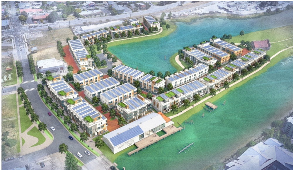
Figure 3: Illustrative perspective of proposed project

As required by §3.040.C, the inclusionary units would be constructed and occupied concurrently with the market-rate residential units in the project and distributed throughout the residential project site to the fullest extent practicable. The design, appearance, and general quality of the affordable units would be comparable and compatible with the design of the market rate units as determined through the Site Plan and Architectural Review process, provided all other zoning and building codes are met. Affordable units may have a one-car garage option as a trade-off for additional living space.