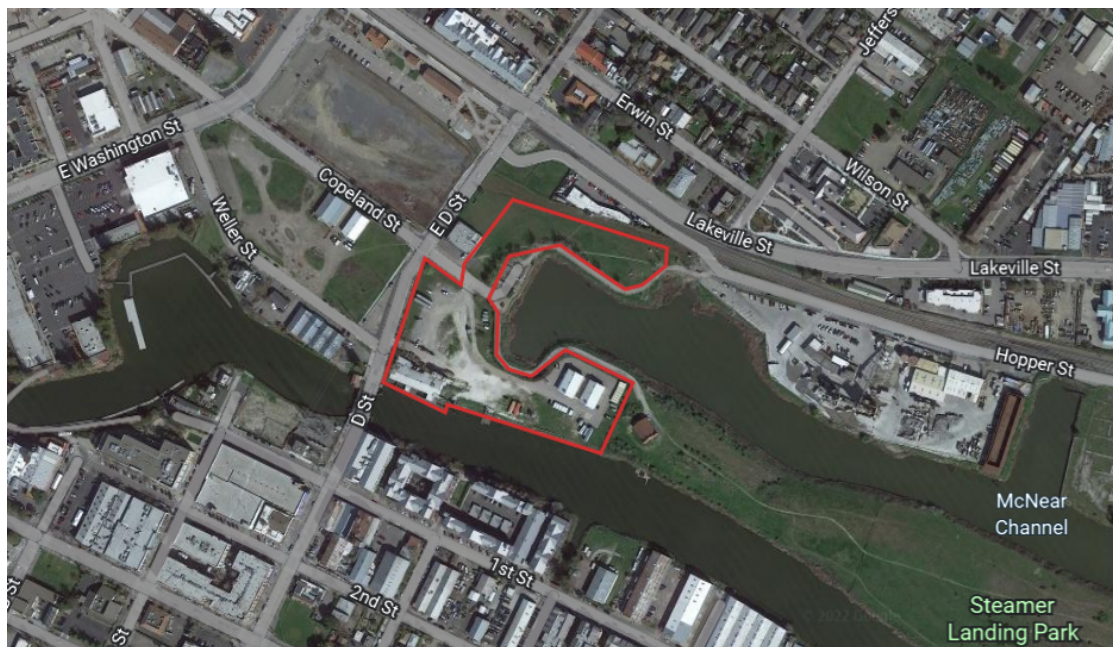
Figure 1 – Proposed project site (boundary in red)

upper section. Properties comprising the project site were historically used for offloading, processing, and distribution of fossilized oyster shells. The site is currently developed with three vacant steel buildings, docks, and moorings located on the southernmost portion of the site closest to the Petaluma River and is used for warehouse and open yard storage of industrial materials.