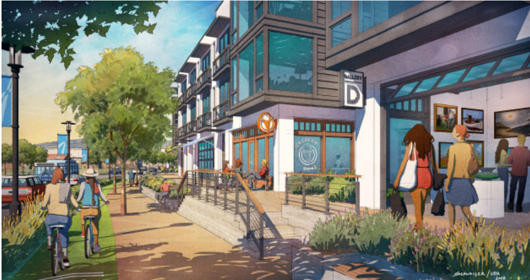
Figure 4: Mix of makers spaces, retail, and galleries along East D Street frontage

Petaluma River are installing a new dock facility at Steamer Landing Park approximately 600 feet east of the Oyster Shed, that would provide water access. The project proposes a publicly accessible multi-use path along the river's edge that would connect the Oyster Shed to Steamer Landing Park. Taken together, these shared amenities activate and enliven what is anticipated to be the most heavily trafficked and visible areas of the site.